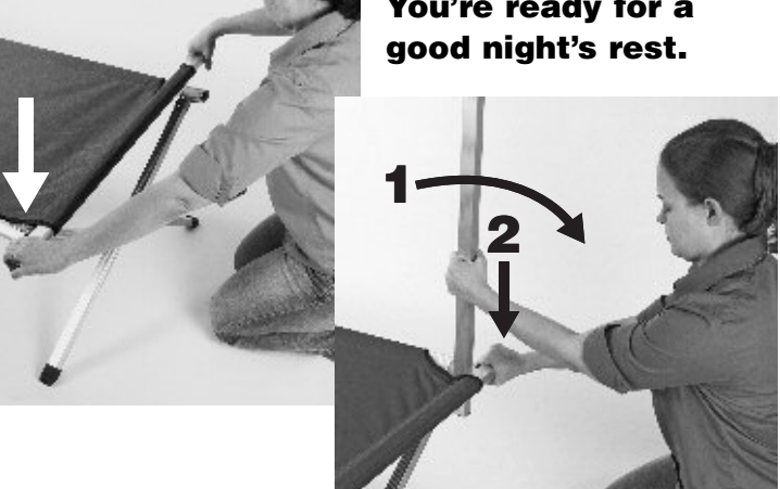
Purchase ProPac cots online at CotKing.com

Know us before you need us. ProPa 1-800-345-3036