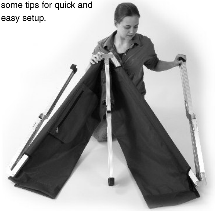
1. Remove cot and end-rails from bag.

ProPac military style cots have sleeping mats that are stretched nice and tight to maximize comfort. This requires a snug fit for the end-rails, so we've included