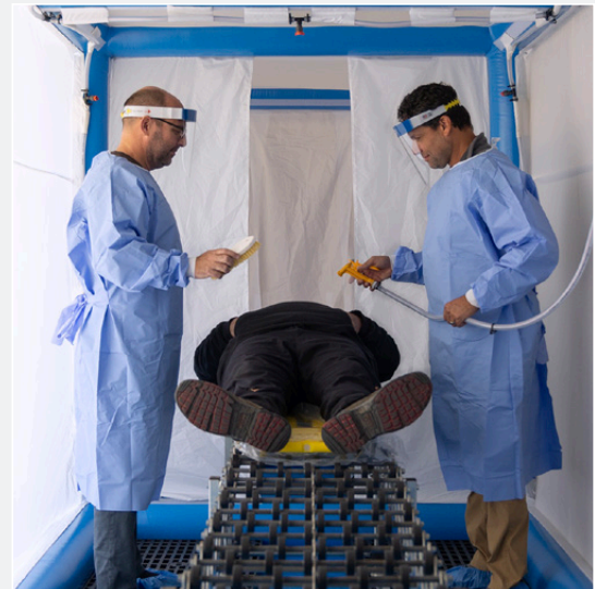
*Optional Backboard Conveyor shown